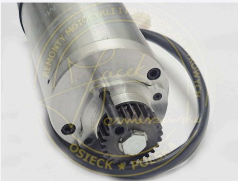
01 DYNAMO DL 5