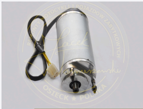
01 DYNAMO DL 6