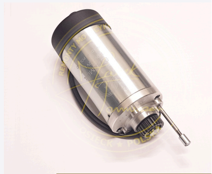
01 DYNAMO DL 7